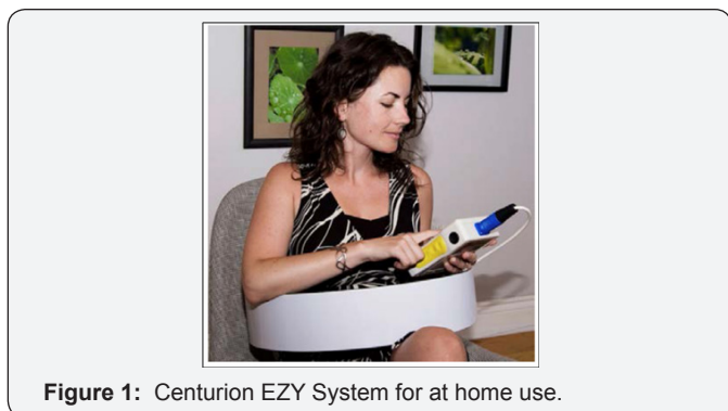
Figure 1: Centurion EZY System for at home use.

The PEMF device used in this study is the Centurion EZY system, which is intended for home use. The portion of the body to be treated is placed within the device, which is a cylinder large enough to fit around the whole body (Figure 1). The device is easy to use, which allowed participants to treat themselves. Two buttons on a remote attached to the cylinder enabled the user to adjust pulse frequency (from 2, 8, 15, and 30 pulses per second) and duration of treatment (20, 30 to 60 minutes). Participants were instructed to use the therapy two to three times each week over the course of four weeks in the local chiropractic clinic.