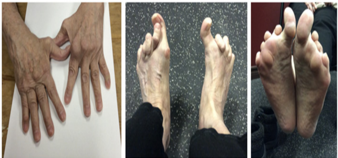
Figure 2: Case 1 is a 64-year old female with severe deformity of hands and feet due to osteoarthritis. These photographs were taken before PEMF therapy. No changes were noted in the degree of deformity following PEMF treatments.

Case 1 is a 64-year-old female who was diagnosed with arthritis in the hands and feet 34 years ago. She is five feet tall, 165 pounds, and reports very light daily activity. The participant experiences symptoms of arthritis throughout her body and also experiences pain and mobility issues in her arms. Case 1 suffers from severe finger and hand and foot deformities and had the most advanced arthritis in the study (Figure 2). Her major concerns were weakness and immobility (Table 1). This individual received a total of nine 20-minute treatments to shoulders and feet.